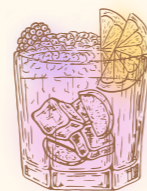
Blackcurrant Bramble - 9.50

Tanqueray Royale & Edmond Briottet Crème de Mûre