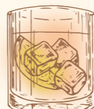
Old Fashioned - 10.25

Sheffield Dry Gin, Carpano Antica Formula Vermouth & Campari