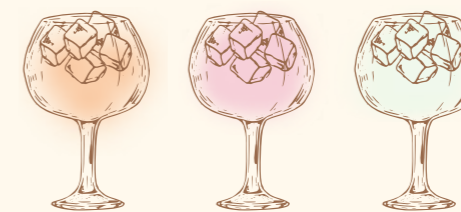
Aperol / Sarti Rosa / Hugo - 9.50