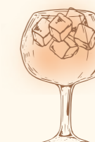
Crodino Spritz - 6.00

Captain Morgan Spiced Gold Rum 0%, Pineapple Juice, Bundaberg Ginger Beer, Mint & Lime