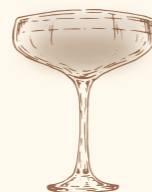
Espresso Martini - 9.75

Sheffield Dry Gin, Cucumber & Elderflower