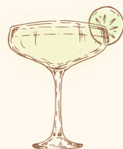
Margarita - all 9.75

Tanqueray Royale & Edmond Briottet Crème de Mûre