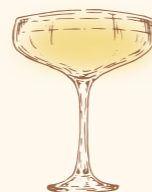
Pornstar Martini - 9.50

Olmecca Blanco / Reposado Tequila, Cointreau, Lime & Agave