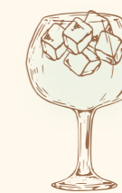
Elderflower Collins - 5.75

Gordon's Pink Gin 0%, Cranberry Juice, Grenadine, Mint & Lime